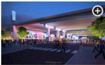
I-4 Ultimate - I-4 Downtown Viaduct - Renderings courtesy of I-4 Mobility Partners