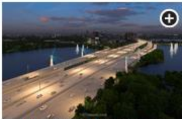
I-4 Ultimate - I-4 and Ivanhoe - Renderings courtesy of I-4 Mobility Partners