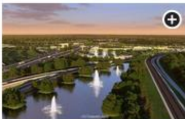
I-4 Ultimate - I-4 and Maitland Ave.