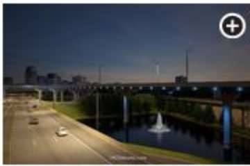
I-4 Ultimate - I-4 and 408 - Renderings courtesy of I-4 Mobility Partners

Posted: Sep 19, 2014 7:02 AM EDT Updated: Sep 19, 2014 7:10 AM EDT By Caitlin Meade -